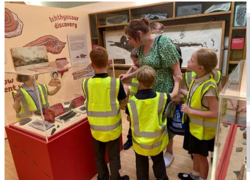
Pathfinders at the Yorkshire Museum

The year 1 and year 2 pupils had an amazing day. Our Adventurers had the fantastic opportunity of going to the Sheffield Lyceum to watch 'Madagascar'. This was linked to their previous topic on Africa and all pupils and staff thoroughly enjoyed the experience. Finally, the year 6 pupils had a residential trip to Kingswood, where they took part in many adventurous activities such as climbing, fencing and zip wiring. As you can imagine, they had an amazing time, as did the two members of staff who went along. All groups, as always with our school, demonstrated 'ready, respectful and safe' behaviour throughout their visits – we are very proud of them.