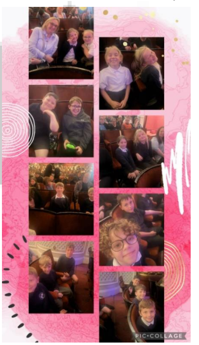
Adventurers at Sheffield Lyceum